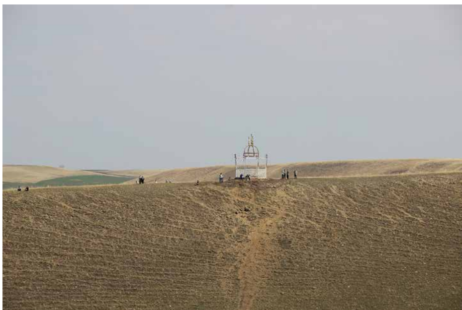
Fig. 4. Border №2 (Awliya Grave) (photo by A. Tuzbekov, May 2015).