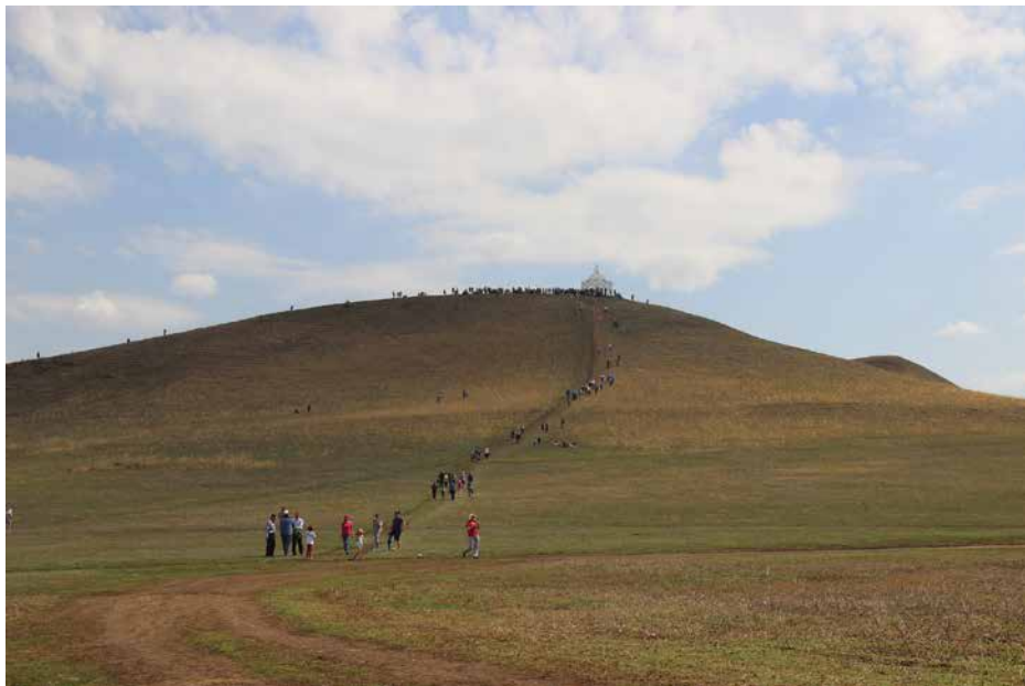
Fig. 3. Border №1 (“Sahaba grave”, “Emir Edigey’s grave”) (photo by A. Tuzbekov, May 2015).