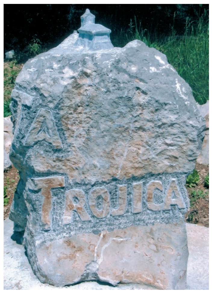
Sv. Trojica (Holy Trinity) by Pivka - Signpost.

that remained at home, mostly children and old people, later settled in other places.<sup>3</sup>