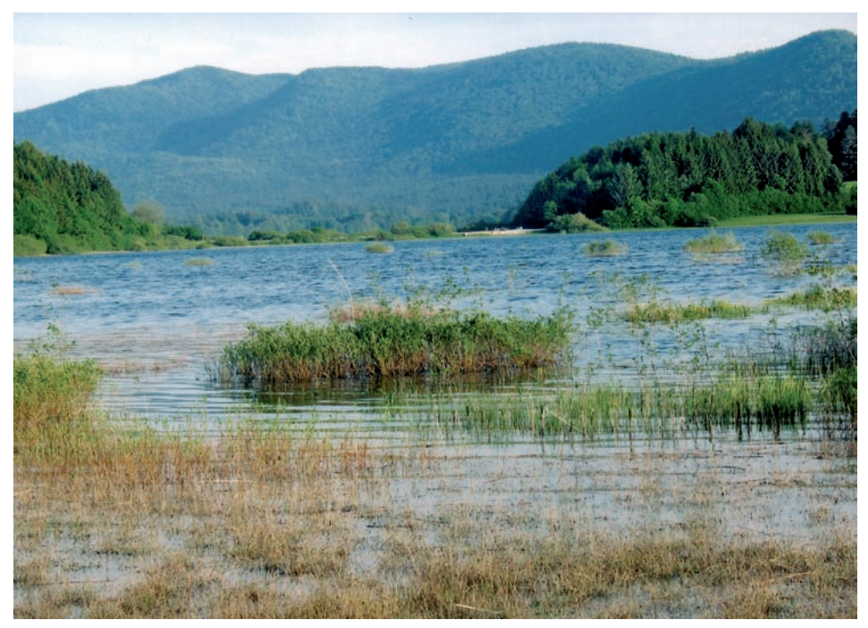
Lake Cerknica, 2005

»Pogljed jo, je žje šla! Tam pr krjese je dajlala svuoje okule.« So rjekle. Pa nč naj muogla. Taku je je blu žje popraje rojenu. U zibko položenu. (Ivanka Širca, Kozarišče, February 1997), no. 5.