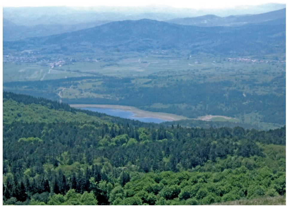
Lake Petelinje and the view of Slovenska vas from the top of the Sv. Trojica Mountain.

Herman je bil nepojmljivo strog in resen človek. Ženske v grajski pristavi niso smele rediti kokoši, saj ga je hrup kokodakanja in kikirikanja strašansko motil. Ko se je na primer odpravljal na sprehod po parku, so morala dekleta na stezice polagati mah, da ne bi slučajno pod njegovimi nogami počila kakšna vejica.